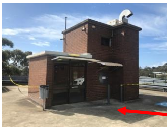
Entrance to lift

Access to the studio via the lift is available above the NSW Services end of the rooftop parking. Once you arrive at ground floor a path that runs along the front of the building will connect you to the studio.